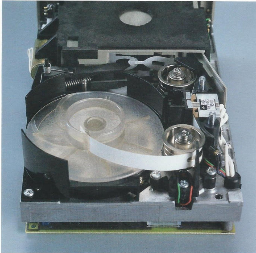
The white plastic leader allows automatic threading of tape through the TK50's simple tape path. The recording surface touches only the head, thus minimizing mechanical wear and enhancing data integrity.

A tachometer mounted in a tape path roller guide provides accurate feedback directly to the microprocessor which then exerts precise control over the motors. The motors themselves minimize speed and torque variations and enhance the drive's uniform operation.